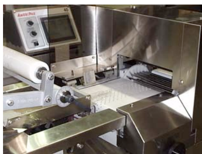
Static Lap Seal